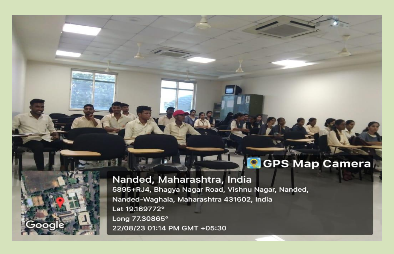
PARTICIPANTS ARE IN INDUCTION PROGRAM.