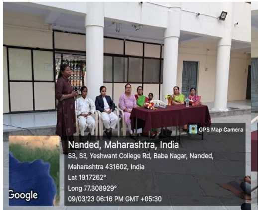
Nanded, Maharashtra, India S3, S3, Yeshwant College Rd, Baba Nagar, Nanded, Maharashtra 431602, India Lat 19.17262° Long 77.308929° 09/03/23 06:16 PM GMT +05:30