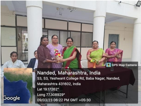
Nanded, Maharashtra, India S3, S3, Yeshwant College Rd, Baba Nagar, Nanded, Maharashtra 431602, India Lat 19.17262° Long 77.308929° 09/03/23 06:22 PM GMT +05:30