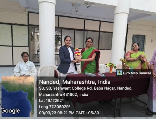
Nanded, Maharashtra, India S3, S3, Yeshwant College Rd, Baba Nagar, Nanded, Maharashtra 431602, India Lat 19.17262° Long 77.308929° 09/03/23 06:21 PM GMT +05:30