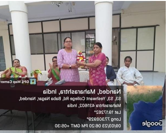
Nanded, Maharashtra, India S3, S3, Yeshwant College Rd, Baba Nagar, Nanded, Maharashtra 431602, India Lat 19.17262° Long 77.308929° 09/03/23 06:20 PM GMT +05:30