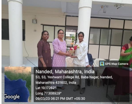
Nanded, Maharashtra, India S3, S3, Yeshwant College Rd, Baba Nagar, Nanded, Maharashtra 431602, India Lat 19.17262° Long 77.308929° 09/03/23 06:21 PM GMT +05:30