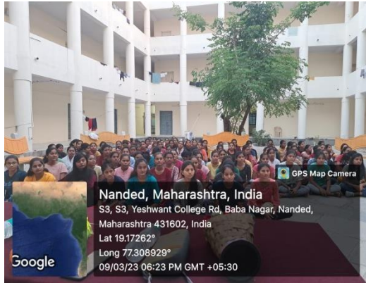
Nanded, Maharashtra, India S3, S3, Yeshwant College Rd, Baba Nagar, Nanded, Maharashtra 431602, India Lat 19.17262° Long 77.308929° 09/03/23 06:23 PM GMT +05:30