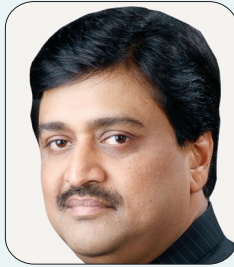
Hon'ble Ashokraoji Chavan Member of Parliament in the Rajya Sabha, Former Chief Minister, Govt. of Maharashtra & President, SSBES, Nanded