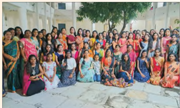
Celebration of Women's Day