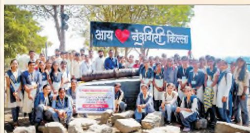
Visit to Historical Places by B.A. Students