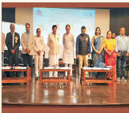
International Conference on IKS By the department of Hindi 9 & 10 February, 2025