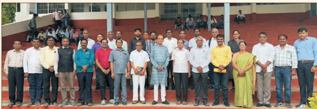
New IQAC members of the college with Hon. D.P. Savant, Secretary SSBES Nanded