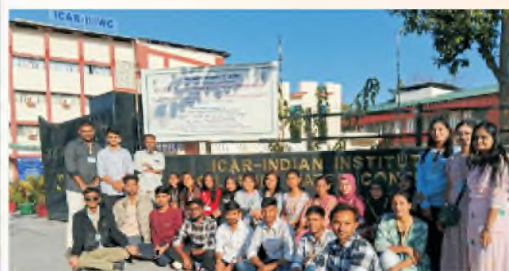
Educational Tour to Research Institute

Note: Subjects Group combination are formed as per SRTMU Nanded Norms (Circular Dated 31.05.2024)