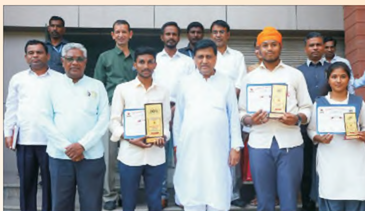
Felicitation of Avishkar 2025 State Level Students by Hon. Shri Ashokrao Chavan, Former Chief Minister M.S., President, SSBES and others