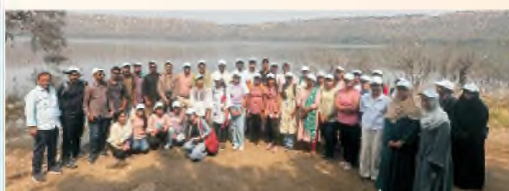
Field Visit to Biodiversity Spot