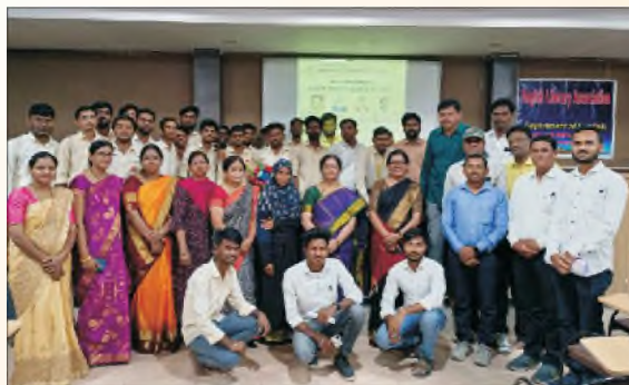
Parent Teacher Meet