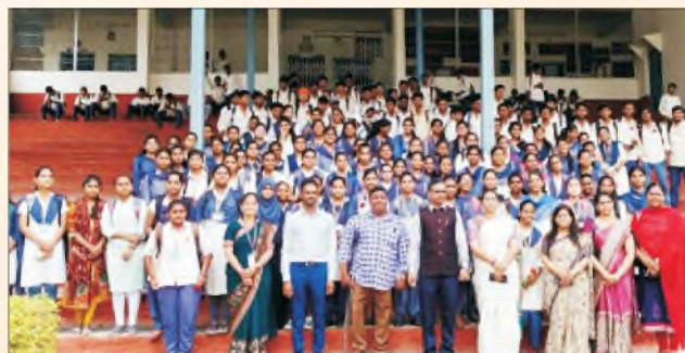
Commerce Association Inauguration