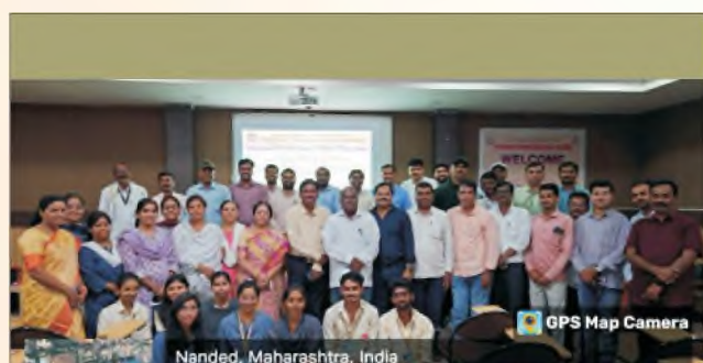
Project Formulation Workshop