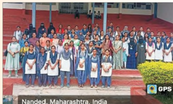
Girls safety week