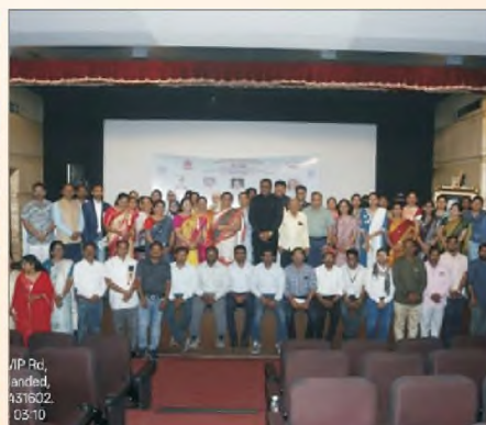
International Conference on ELLT by Department of English 3 & 4 February, 2025