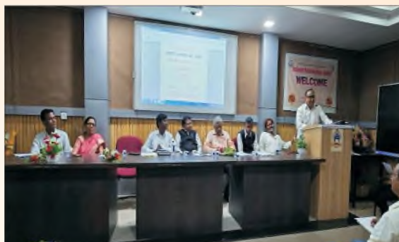
Yeshwant Prabodhan Vyakhyanmala