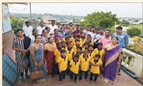
Community Outreach Programme

Women empowerment & Confidence Building Programs : Women empowerment & Confidence Building programs for girls are designed to empower girl students by