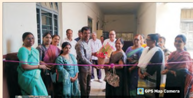
Rangoli Competition Inauguration