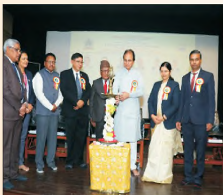
International Conference of Commerce on Road Map of India 2047 on 17&18 Feb. 2025