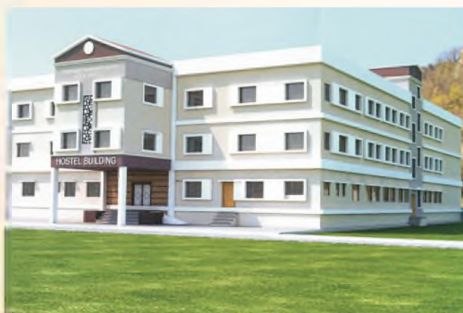
Elevation Model of Boys' Hostel Under Construction

Provided that where the persons committing or abetting the act of ragging are not identified, the institution shall resort to collective punishment. The students are advised to consult Committee in case of emergency.