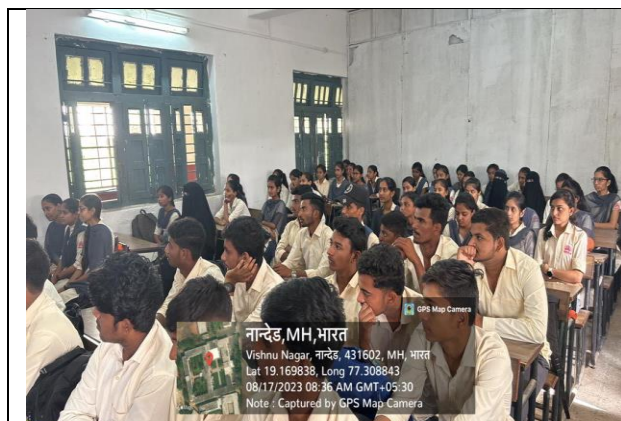
Active participation by B.Sc. I Year Students