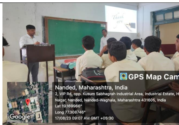
Vote of thanks and ending session