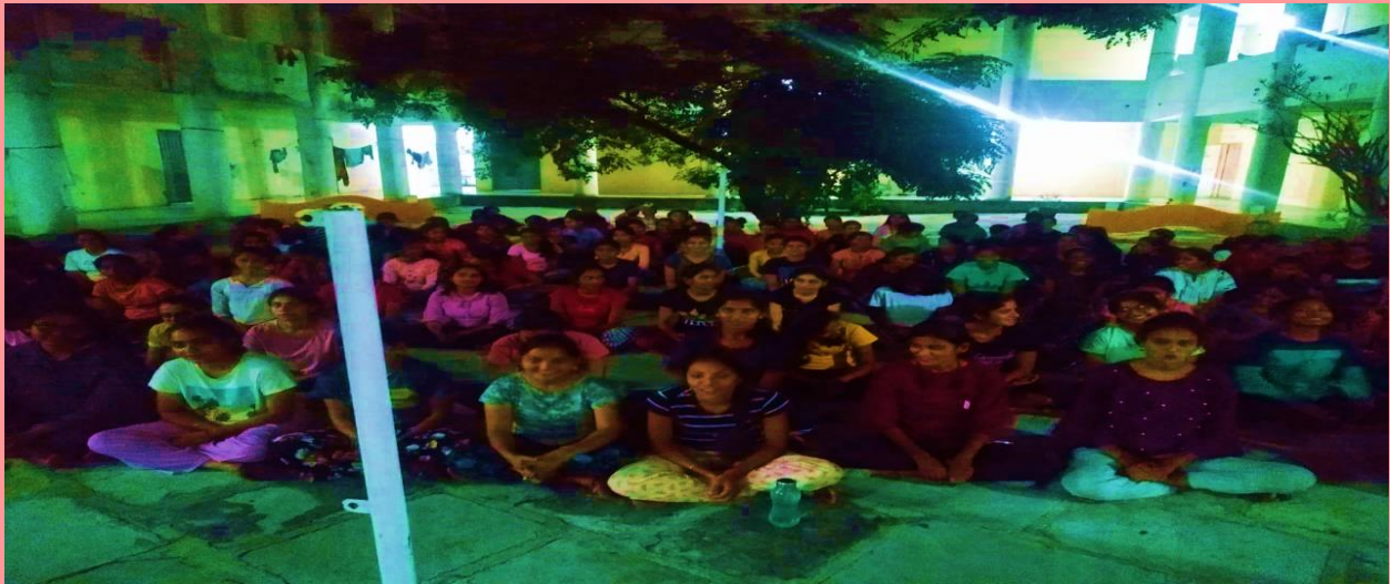
NEW YEAR CELEBRATION