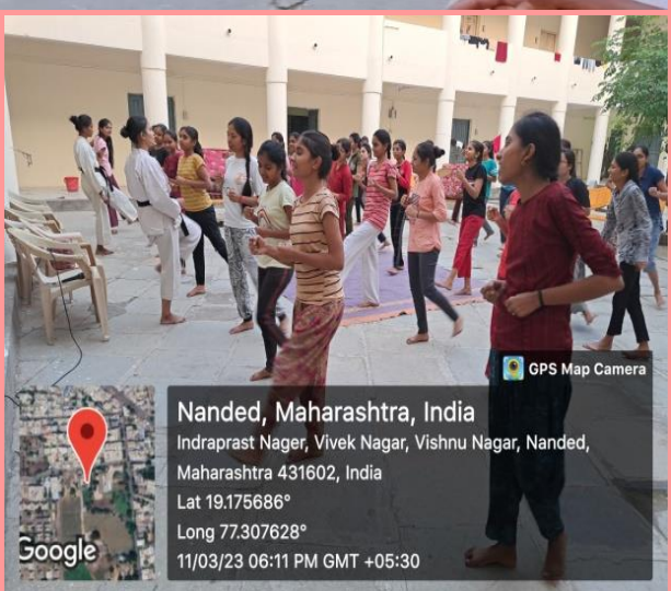
Nanded, Maharashtra, India Indraprast Nager, Vivek Nagar, Vishnu Nagar, Nanded, Maharashtra 431602, India Lat 19.175686° Long 77.307628° 11/03/23 06:11 PM GMT +05:30