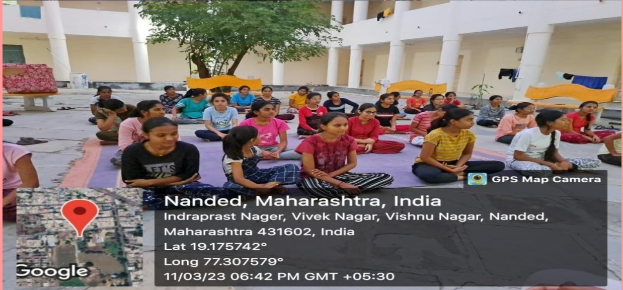
Nanded, Maharashtra, India Indraprast Nager, Vivek Nagar, Vishnu Nagar, Nanded, Maharashtra 431602, India Lat 19.175742° Long 77.307579° 11/03/23 06:42 PM GMT +05:30