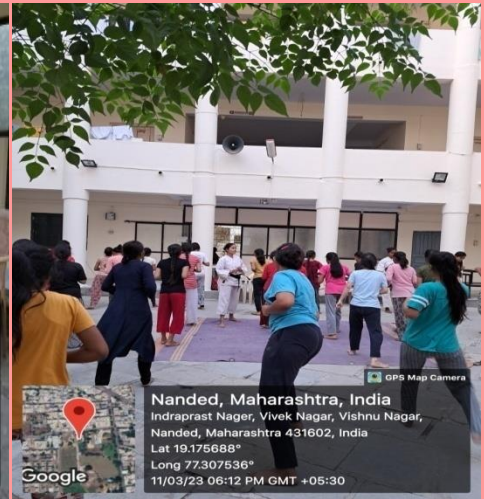
Nanded, Maharashtra, India Indraprast Nager, Vivek Nagar, Vishnu Nagar, Nanded, Maharashtra 431602, India Lat 19.175688° Long 77.307536° 11/03/23 06:12 PM GMT +05:30