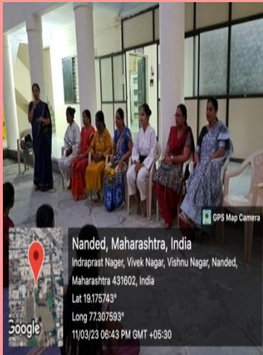
Nanded, Maharashtra, India Indraprast Nager, Vivek Nagar, Vishnu Nagar, Nanded, Maharashtra 431602, India Lat 19.175743° Long 77.307593° 11/03/23 06:43 PM GMT +05:30