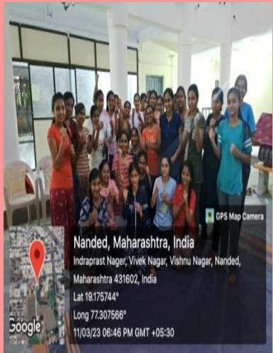
Nanded, Maharashtra, India Indraprast Nager, Vivek Nagar, Vishnu Nagar, Nanded, Maharashtra 431602, India Lat 19.175744° Long 77.307566° 11/03/23 06:46 PM GMT +05:30